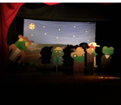
6G performing Romeo the Toad and Juliette the Frog Puppet Show