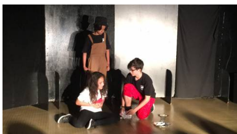
A scene from Three Kings by 6G