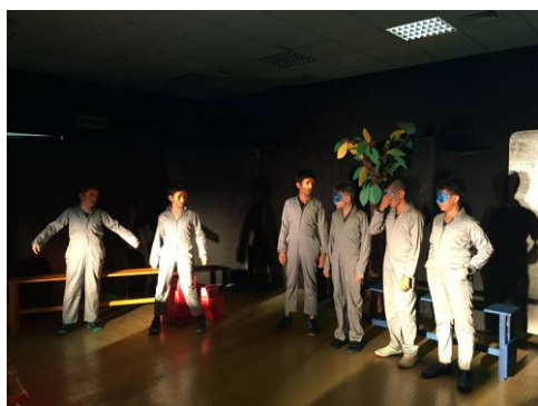
A scene from Masks of Various Colors (6G)

The MS drama program is purposefully designed to allow students the opportunity to shine on and off stage during the end of each semester's Theatre Festival. This semester was no different. Students learned skills in directing, production management, stage management, costumes, makeup, props and set, puppetry, mime, lights and sound design/operation, house management, public relations and media, script writing, lines memorization, and stage acting techniques. The life lessons of responsibility, confidence, diligence and so much more are learned through the process, either knowingly or unknowingly to the learners. This festival brought meaningful collaboration of Drama students with ELL students who were given an opportunity to showcase their English speaking skills. Drama students also collaborated with Art students to coordinate our first attempt at a puppet show. Our audiences combined students, staff, parents, and administration who gave the thespians a real life experience of achieving success and feeling pride.