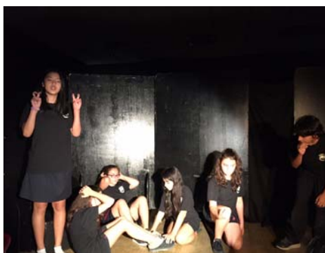
6G ELL and Drama Collaboration on Diary of a Wimpy Kid