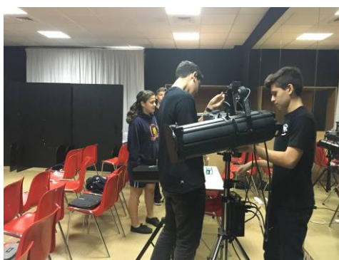
8th grade students setting up the lights