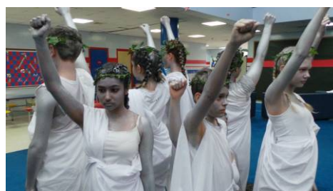
8th Graders posing as Living Statues in the Commons before their performance.