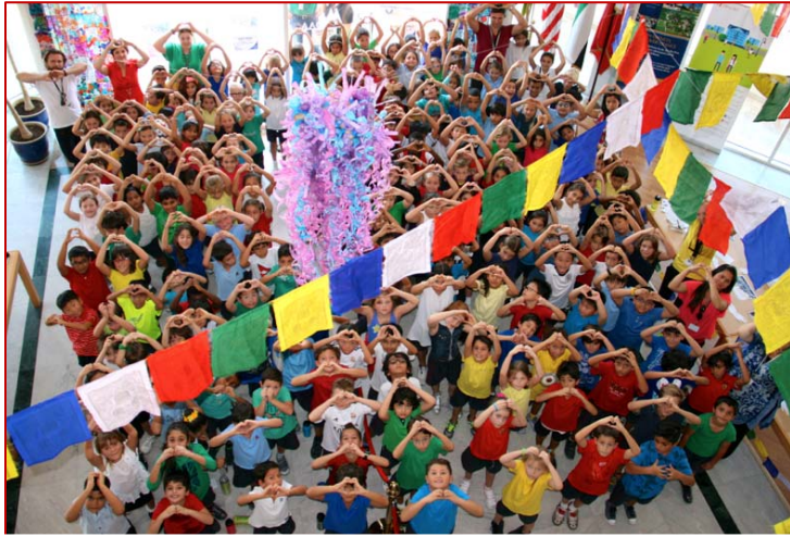
Grade 2 sending lots of love to the people of Nepal.

There are many things we love about being at DAA, but one of them is being part of a community that is so internationally minded. This particularly comes to light when we pull together to help support others in a time of tragedy, as happened with our Nepal Fund Raising efforts on Thursday. In addition to raising money for those in need that will go to Nepal via Red Crescent (and we raised a lot!) over the past week our kids have further developed that sense of international mindedness and the importance of helping and supporting others in their time of need. This is a key component of global citizenship and DAA's Mission and something that we all